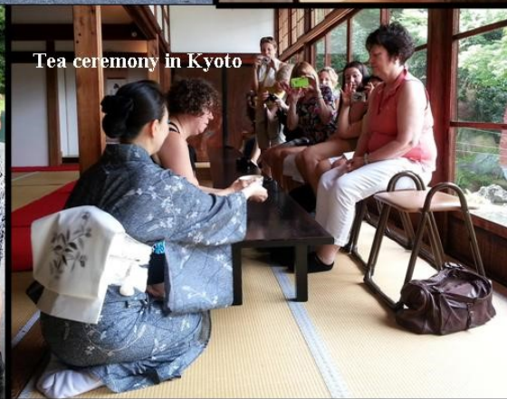
Tea ceremony in Kyoto