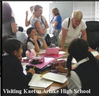
Visiting Kaetsu Arlake High School