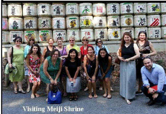
Visiting Meiji Shrine

OFFICIAL VISITS: meetings with the Japan Overseas Education Services and Shinohara Edo Furin.