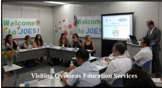
Visiting Overseas Education Services

This year's delegation of 12 educators and 3 guests made the following journey: NYC ► Tokyo ► Miyagi ► Hiroshima ► Kyoto ► Nara ► Hakone ► Tokyo ► NYC