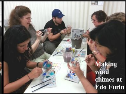
Making wind chimes at Edo Furin

OFFICIAL VISITS: meetings with the Japan Overseas Education Services and Shinohara Edo Furin.