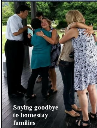
Saying goodbye to homestay families

SCHOOL VISITS: observing classes, eating lunch with students, and Q&A with staff at 1 elementary, 1 middle, and 1 high school.