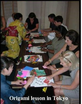
Origami lesson in Tokyo

CULTURAL VISITS: visits to historically significant and beautiful UNESCO sights and museums, hands-on arts & crafts activities, overnight home stay with local families, and a lecture from an atomic bomb survivor.