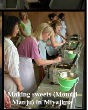
Making sweets (Momiji Manju) in Miyajima