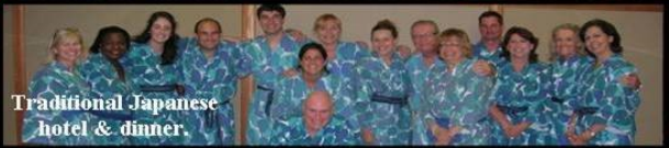
Traditional Japanese hotel & dinner.