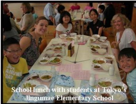
School lunch with students at Tokyo's Jingunae Elementary School

NYC ▶ Tokyo ▶ Hiroshima/Miyajima ▶ Kyoto ▶ Toyama ▶ Tokyo ▶ NYC