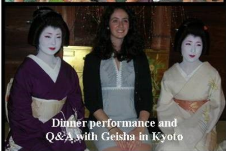
Dinner performance and Q&A with Geisha in Kyoto

CULTURAL VISITS: visits to historically significant and beautiful UNESCO sights and museums, hands-on arts & crafts activities, overnight home stay with local families, and a lecture from an atomic bomb survivor.