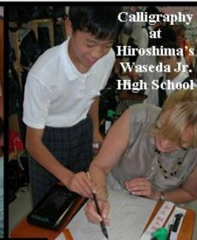
Calligraphy at Hiroshima's Waseda Jr. High School

OFFICIAL VISITS: meetings with Tokyo Metropolitan Govt. BOD, Japan Overseas Education Services, the Governor of Toyama Prefecture, and Hamano Products.