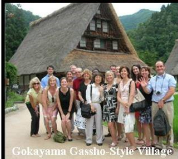
Gokayama Gassho-Style Village