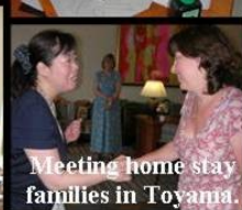
Meeting home stay families in Toyama.

SCHOOL VISITS: observing classes, eating lunch with students, and Q&A with staff at 2 elementary, 1 middle, and 1 high school.