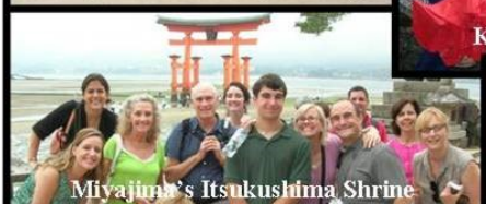
Miyajima's Itsukushima Shrine