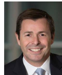
Simon Winchester Author & Journalist