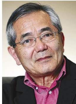
Ei-ichi Negishi Scientist & Professor