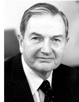
David Rockefeller Philanthropist & Business Leader