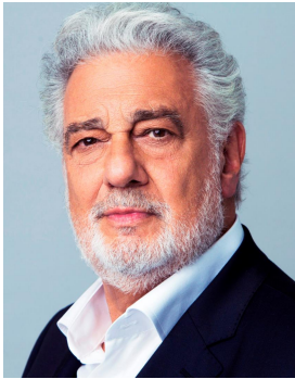
Placido Domingo Opera Singer & Conductor